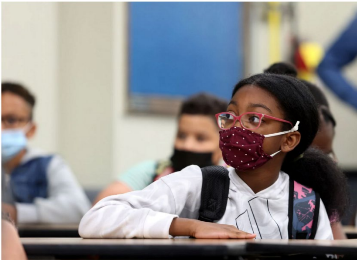
A student listened to a teacher as he calls off names for each new classroom in the seventh and eighth grade community meeting on the first day of school at the Academy of the Pacific Rim Charter Public School on Aug. 30.